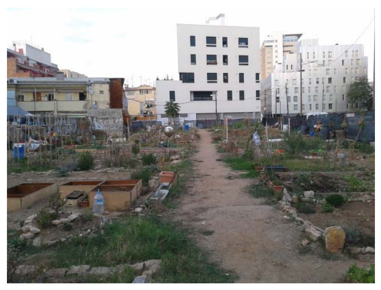
Figure 2. Poblenou indignant garden.