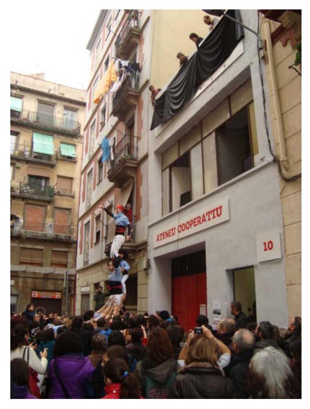
Figure 4. The inauguration of La Base.