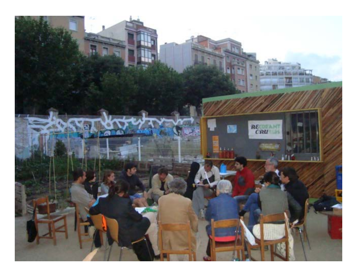
Figure 3. The setting of Recreant Cruïlles.